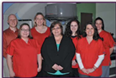
All Board Certified Staff