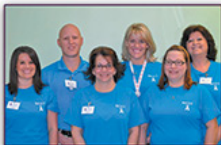
All Board Certified Staff

1 OF 2 TREATMENT MACHINES IN 5 SURROUNDING STATES